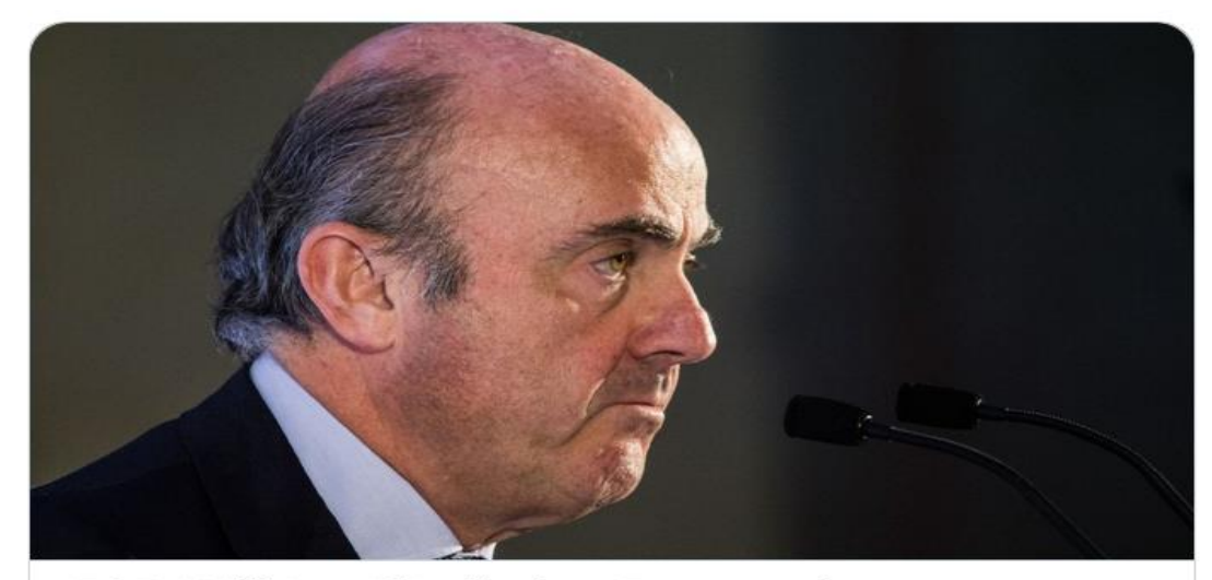
ECB Will Act If Inflation Expectations Deteriorate, Guindos Says bloomberg.com

The European Central Bank's vice president says policy makers will add stimulus if inflation expectations become deanchored